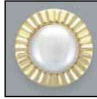
Pearl Insert P-3754P $47.25