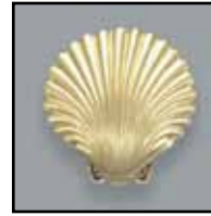
Shell P-3754H $47.25