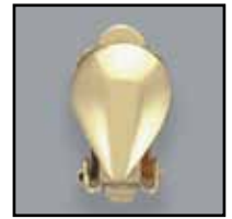
Children/Upper Ear With Silicone Pads Only P-3747 $38.75