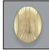
Oval P-3752 $47.25