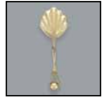
Brent Pressure Earring Wide Lobe P-3751 $96.00