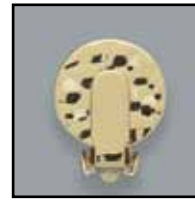
Sleeper Style P-3748 Avg. Lobe $38.75 P-3749 Wide Lobe $38.75