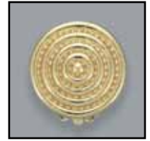
Shield P-3754S $47.25