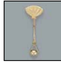
Brent Pressure Earring P-3750 $40.75