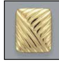
Square Style P-3755 Avg. Lobe $47.25 P-3753 Wide Lobe $47.25