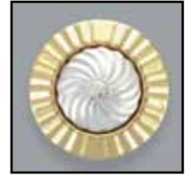
Silver Insert P-3754I $47.25